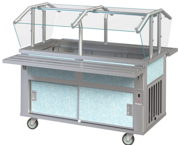
5-BCM shown with optional SRTS, BPGC and laminated finish

The Piper Elite 500 Bloomington mechanically refrigerated, extra deep well unit is listed NSF/ANSI Standard 7. Food is recessed on easily removable rails in the pan for maximum cooling efficiency without the use of ice and is ideal as a salad bar merchandiser. Elite 500 units are compatible and will interlock with other Elite 500 units.