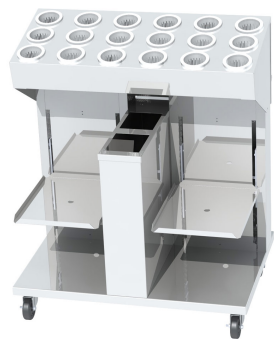
2ATCA-SN Shown with optional silverware cylinders