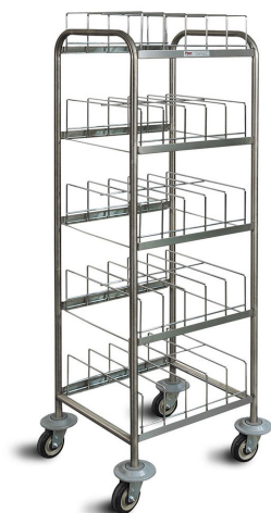
411-1484 (Shown with optional rotating bumper)