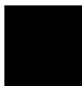
Formica Black Matte Finish