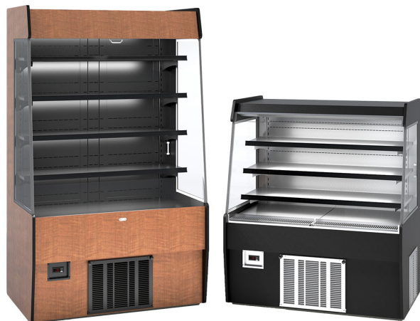
HPRO and LPRO

*Custom laminate colors are available. Contact factory for options and pricing.