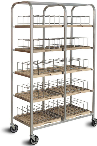
411-1151 or 190-1077

The Piper Dome Storage Carts are a practical way to store and dry plastic, plastic single wall and most insulated style domes. The molded underbases can be stored in the same fashion.